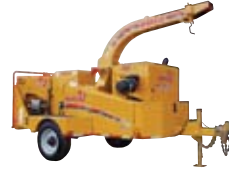
RC 16.5 Diesel Powered, Drum Style

Powder Coat Paint Torflex® Axle VERSA-FEED PULSE® Infeed Technology Self Adjusting Clutch Hydraulic Lift Assist Fuel Saver Mode