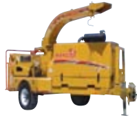
RC 12Dx Turbo Charged Diesel Powered, Disc Style

Powder Coat Paint Torflex® Axle VERSA-FEED PULSE® Infeed Technology Self Adjusting Clutch Hydraulic Lift Assist