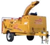
RC 12 Diesel Powered, Drum Style

156" / 184" (396.2 cm / 467.4 cm), adjustable 77" (195.6 cm) 6,120 lb (2,776 kg) CAT 86 hp (64.1 kW) 24.5 gal (92.7 L) 12" diameter (30.5 cm) 360°