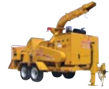
RC 20Dx Turbo Charged Diesel Powered, Drum Style

Powder Coat Paint Torflex® Axle VERSA-FEED PULSE® Infeed Technology Self Adjusting Clutch Hydraulic Lift Assist Fuel Saver Mode